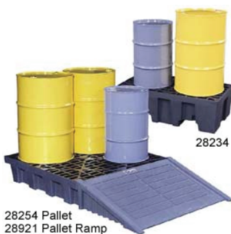
28254 Pallet 28921 Pallet Ramp

Ask about Justrite Spill Containment Pallets